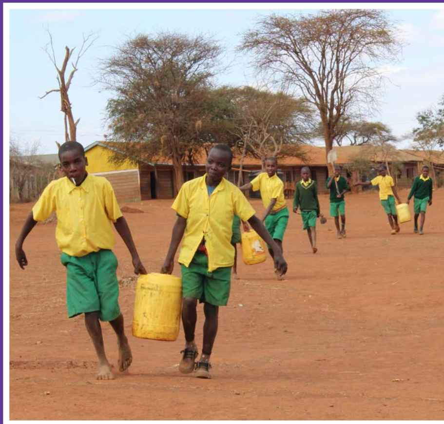
Students from Mbondoni Primary School carrying water to the workshop's demonstration site. Drought has been a major challenge for participating schools in the GIC.