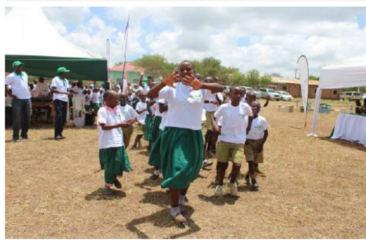
Ielanthi Primary School students celebrate for emerging as as the winners of GIC Phase IV.