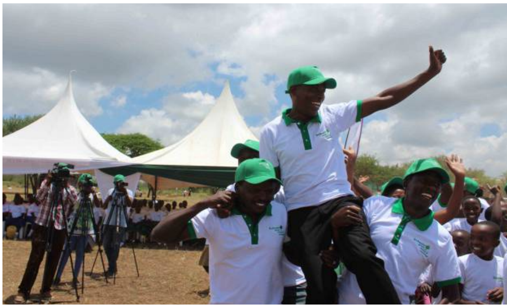
Ielanthi Primary School staff celebrate with their “green teacher” when the school was announced as the winners of GIC IV.

The Phase IV Awards are a culmination of activities that began in 2018, with the enrollment of 100 schools from the three counties.