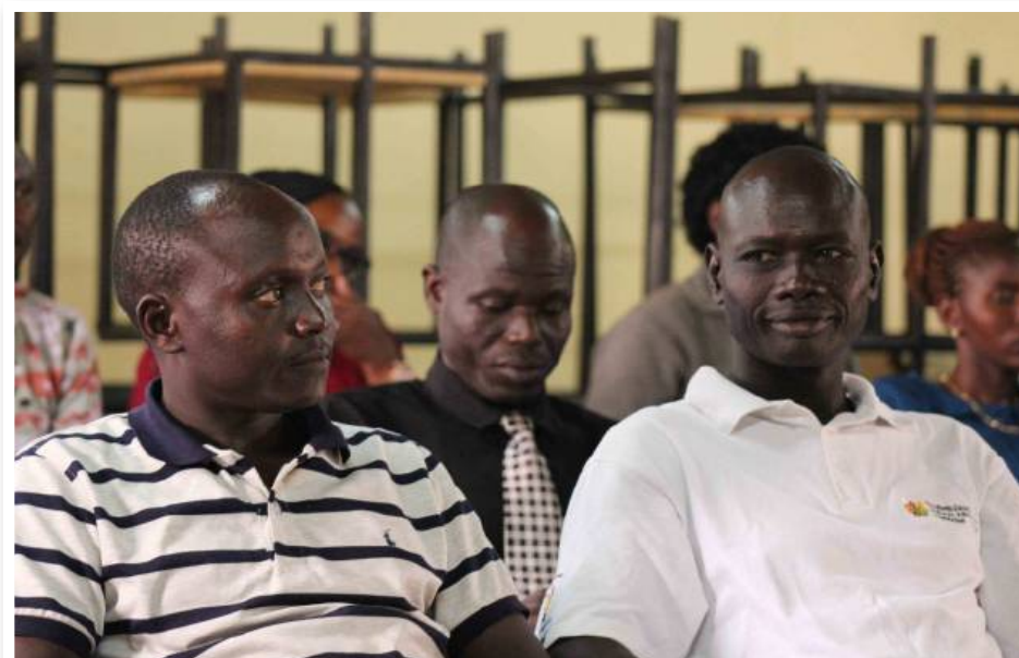
Turkana County "Green Teachers" during the Schools Green Initiative Challenge Capacity Building.