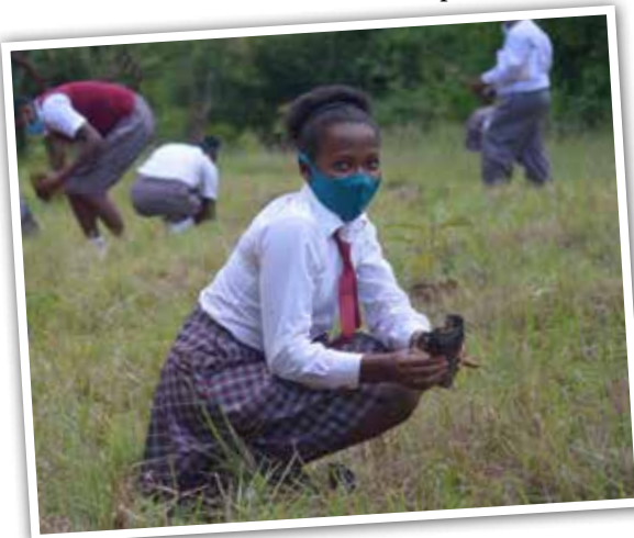
Tree planting in schools, Upper Tana with Givers

Set up in 2015, the KenGen Employee Giver Initiative is instrumental in executing KenGen CSI activities at the company's areas of operations. The initiative was specifically formed to enable KenGen staff donate their skills, expertise, and monetary contributions towards community and environment projects. ■