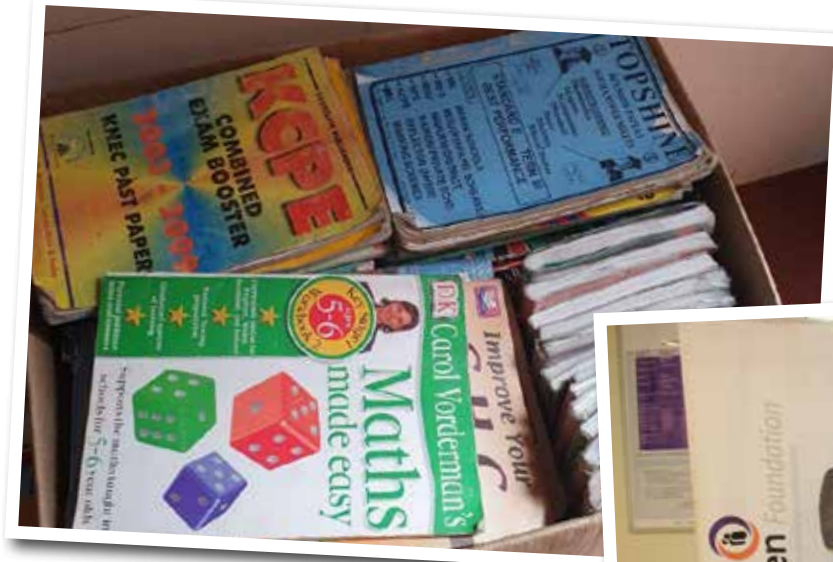
Books collections currently on-going at all KenGen PLC power stations

course books. Novels and other interesting reading materials that target primary, secondary and tertiary levels students are also needed. Collection points at all KenGen Power Stations.