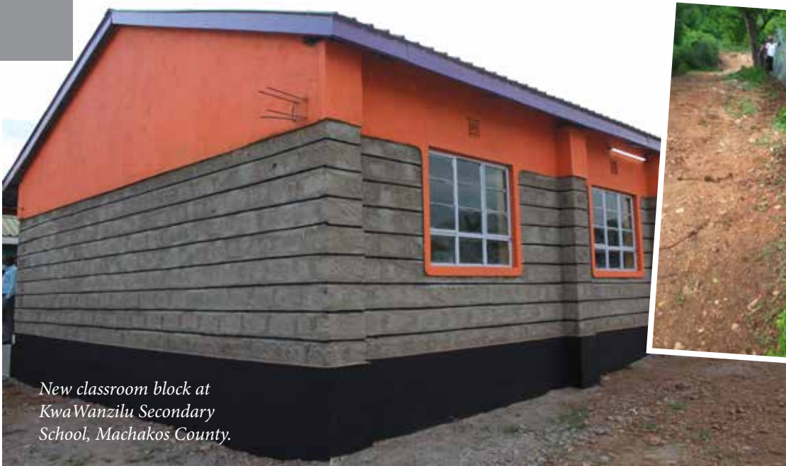
New classroom block at KwaWanzilu Secondary School, Machakos County.