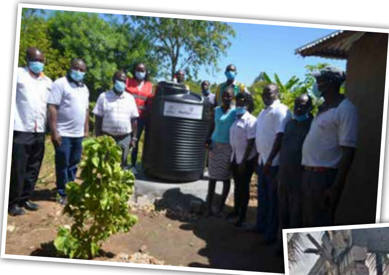
Community Water Tanks distribution, Sondu Miriu