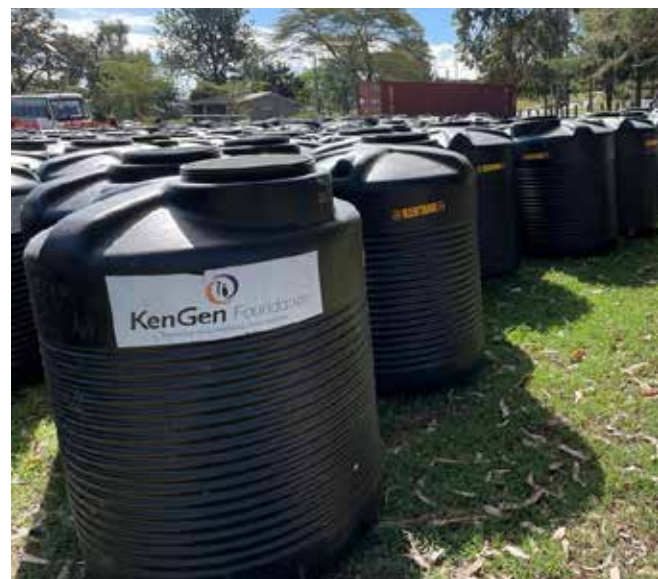
300 (1,000 l) water tanks set for distribution across Nakuru County