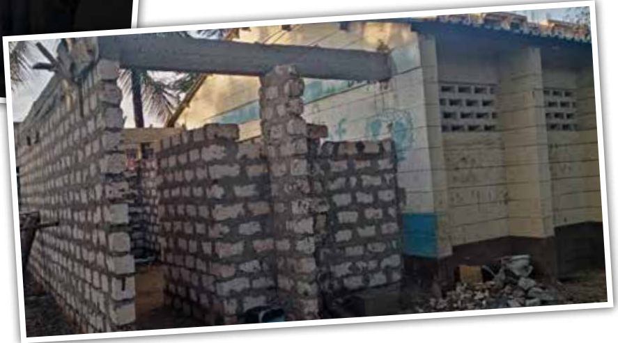
Amani Primary School, Mombasa County - ongoing renovations

While the global corona pandemic has led businesses to pledge to step up as good corporate citizens like never before, this shift has long been happening at KenGen PLC through the Employee Giver Initiative. With the inclusion of social sustainability in the overall corporate strategic plans, engaging employees in participating in Corporate Social Investment programs has become a critical success factor for the company.