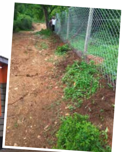
New chainlink fence at Thua Primary School, Kitui County.